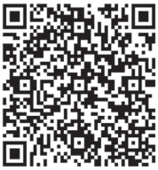
Scan for Android